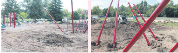
This is the Junction City Elementary playground as of Monday August 29, 2022.

What looked like a demolition project at Junction City Elementary School was transformed into a brand new playground. A new playground was also installed at New Lexington Elementary for the start of the 2022-23 school year.