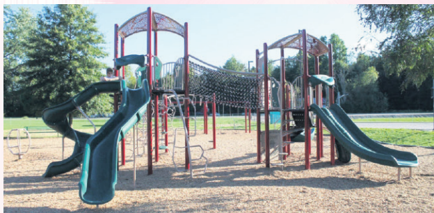
This is the new playground at Junction and was duplicated at New Lexington Elementary. It is much loved by all and it is seeing a great deal of use!