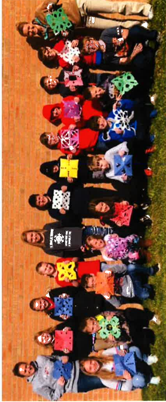
Junction City Elementary participated in the Snowflake Movement which sends snowflakes to Children's Hospital to hang in patients rooms to help brighten their holiday.