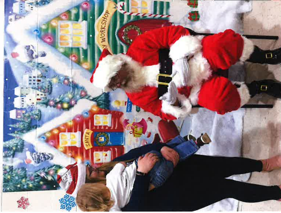
Standing Room only to have pictures taken with Santa!!